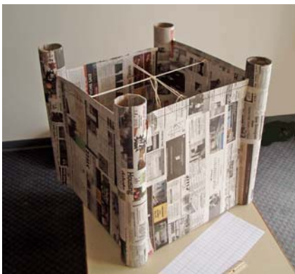
5. The castle is covered with a layer of wide, glued strips of newspaper, inside and outside, and lengths of string fastened across the top, keep the sides straight until the glue is dry.