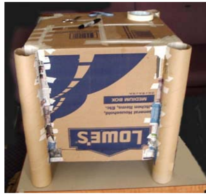
3. The box is then turned upside down and the base strengthened with lengths of masking tape. Notice that the bottom of the towers are level with the bottom of the box.