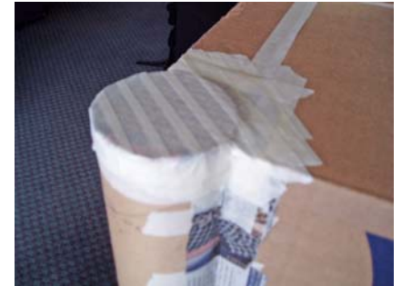
4. The open ends at the bottom of the towers, are taped over as shown, these could then be useful to put things inside.