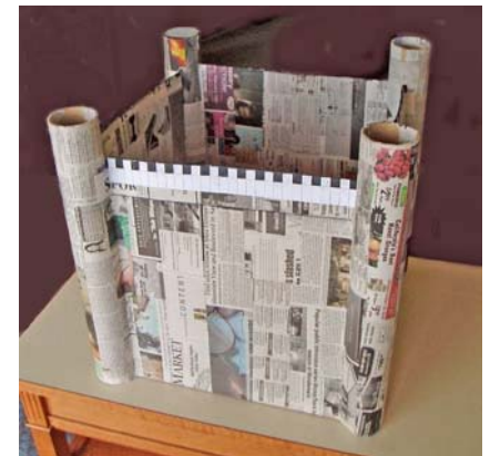
7. The patterned strips are glued along the tops of the walls as shown, then each alternate half inch square on the paper is coloured black to give the effect of a real castle.