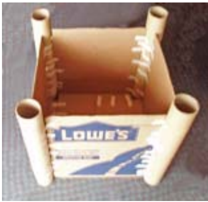
2. Use enough tape, both outside and inside, so that the towers are strong and do not wobble about.