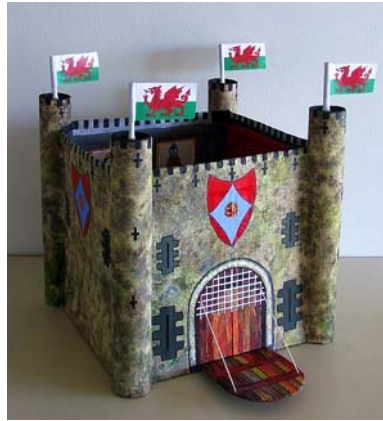
This castle can be used for a storage box or with small modifications, changed into a working castle with an open arched door, a working portcullis, a walkway around the top inside rim, and small figures made from paper tubes.