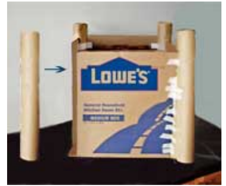
1. The cardboard box is about 18 inches square, and the tube, from a fabric shop is long enough to make 4 round towers. Box corners were cut out, and each tower was taped in place.